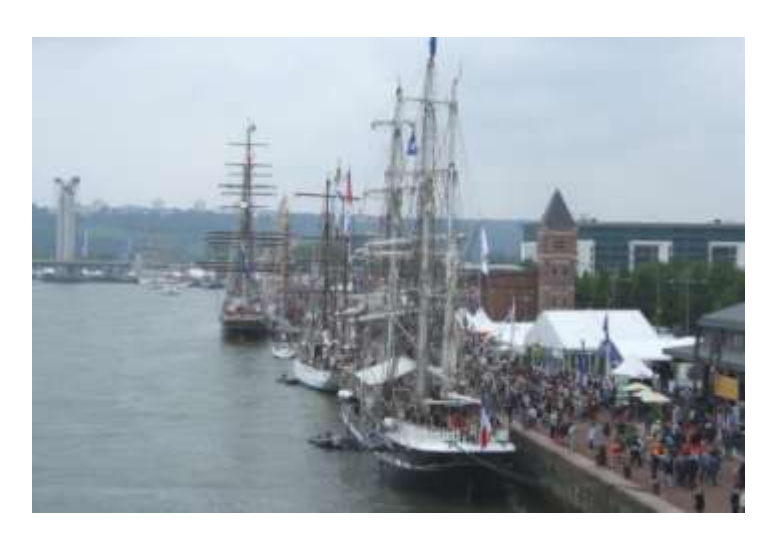
'Tall Ships on the quay'