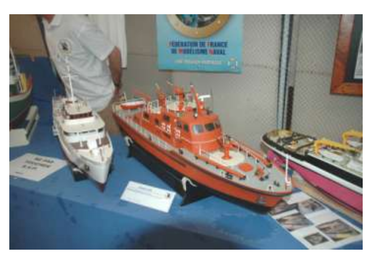
'Rouen Model Boat Club'