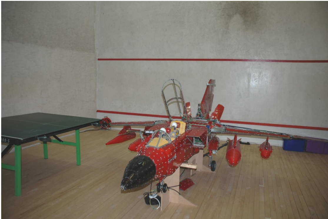
The model is pictured in a squash court and note the size of the model against the full size table tennis table !